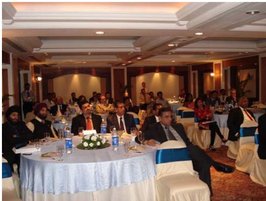
UFI Delegation meets with Indian exhibition representatives in Mumbai.