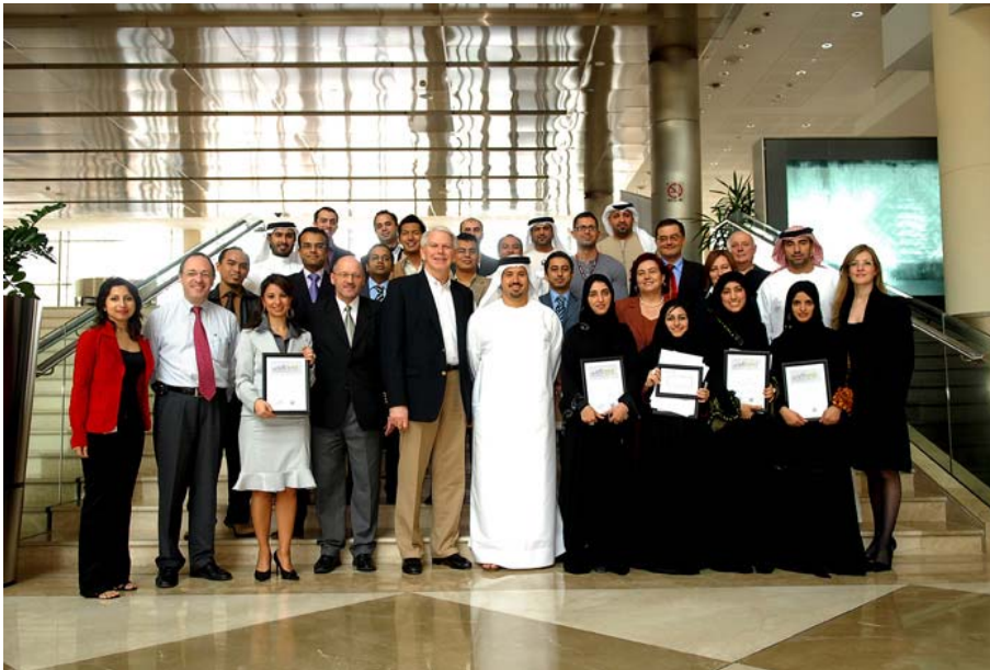
A total of 31 students from 13 countries participated in this EMD course session – including 18 from the UAE.

The Exhibition Management Degree (EMD) is acknowledged worldwide as the international professional standard for the industry. Successful graduates have earned specialised knowledge and practical skills in areas including project management, logistics, and cost control in the specific context of the global and regional exhibition industry. As demand increases for qualified professionals in this sector, the EMD provides the advanced academic education that will aid them in future managerial positions.