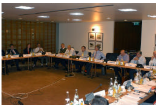
UFI's Steering Committee debated the new UFI strategy and statute changes in Paris in early September.