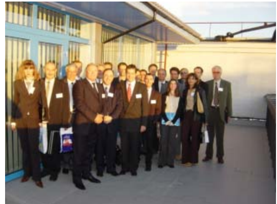
An enthusiastic turnout for the second ICT mini seminar open to all UFI members.

In each case the cost for system implementation was borne by the organizer. It will take a while before operators and organizers can evaluate the profitability of these investments. This will probably be a good impetus for us all to start carrying the Internet as a distinct profit centre.