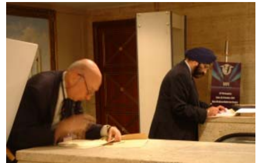
UFI delegates take their voting responsibilities seriously.