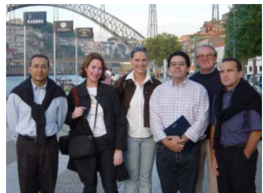
Representatives from Valencia, Barcelona, Leipzig, Porto, Budapest, Zagreb and UFI HQ Paris met in Porto on Sept.29 for the UFI Marketing Committee Meeting.