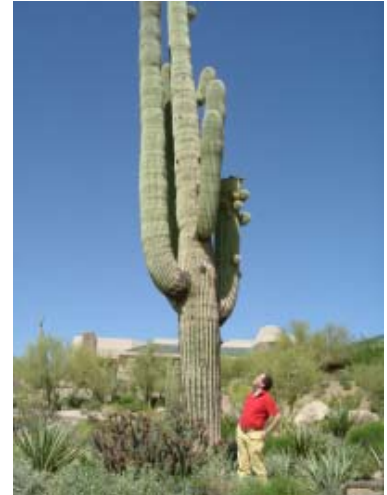
UFI's Managing Director tackling a giant cactus in Arizona during a recent SISO meeting.