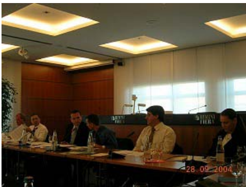
UFI's marketing committee wasted no time in preparing an exciting programme for 2005!

2005 UFI Marketing Committee highlights include the preparation of a "Focus Meeting", theme identification for the next UFI Marketing Award competition and development of a survey on the topic "Matchmaking Possibilities."