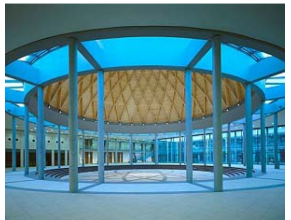
UFI's Board of Directors and Marketing Committee recently were hosted by RiminiFiera, Italy. Our congratulations to The Rimini Expo Centre for their recent selection in the "Phaidon Atlas of Contemporary World Architecture" a publication. Their selection was made from works by 656 architects in 75 countries. Designed by Hamburg's Marg & Partner studio, the project, completed in 2001, is included with acclaimed architectural projects from around the world.

UFI's Board also accepted the applications of 13 new UFI members and 14 new UFI approved events. You'll find these listed on the following page.