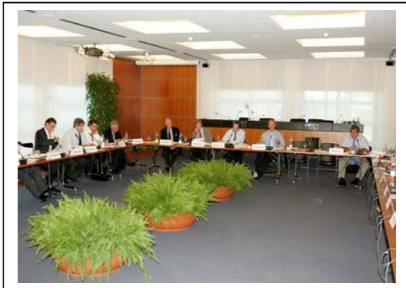
UFI Board Members in RiminiFiera for the next General Assembly session in Bangkok

Hosted by RiminiFiera on 27 September, the UFI Board of Directors reviewed a number of important documents which will be submitted to the General Assembly in Bangkok for approval.