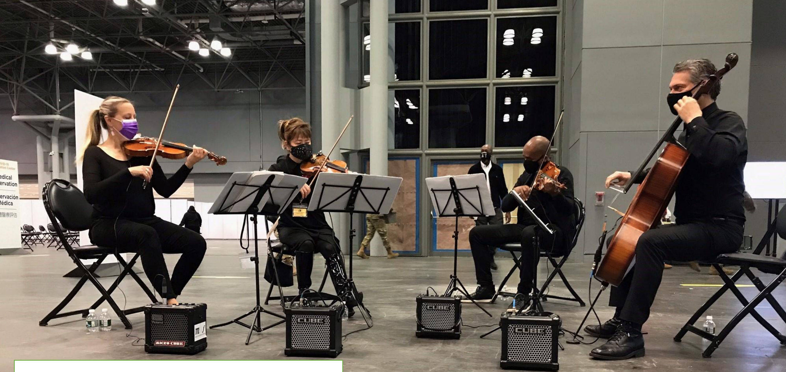
Musicians Playing on a Daily Basis