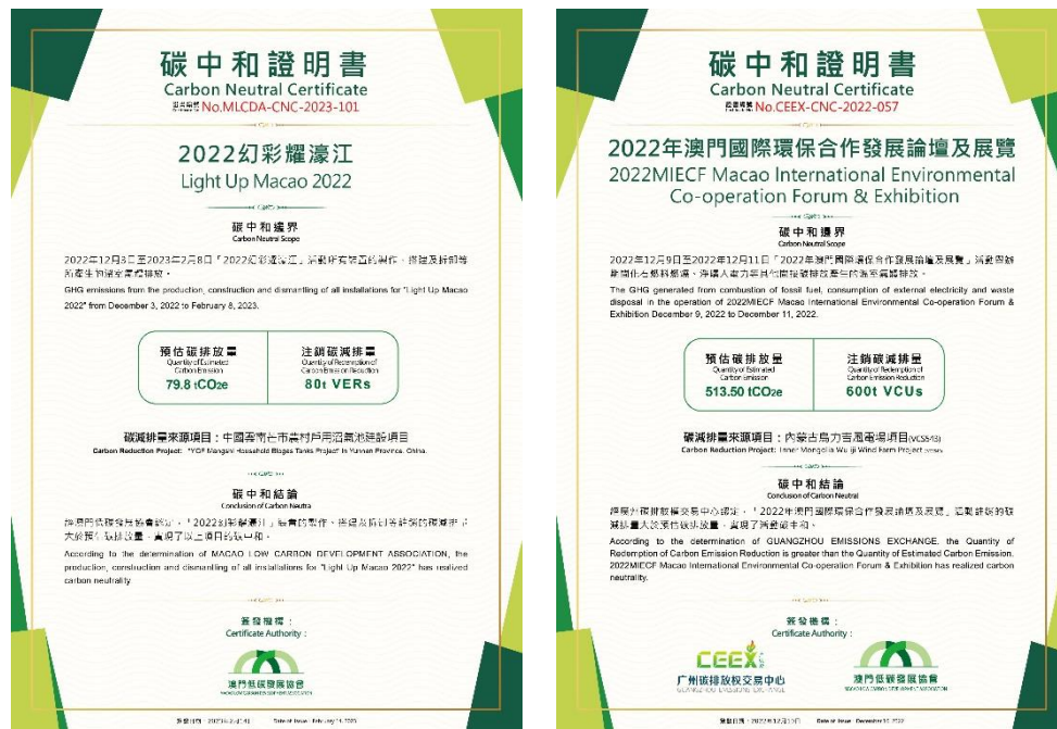
Certificates in carbon neutrality of events

Among the above, the MIECF is worth mentioning. The last edition of MIECF was the first professional exhibition on “Carbon Neutrality” in Macao. The carbon emission calculation of the exhibition was cross-checked with the “Implementation Guidelines for Carbon Neutrality of Large-scale Events (Trial)” issued by the Ministry of Ecology and Environment of China in 2019, and the Calculator to estimate the carbon dioxide emission of 2022MIECF. According to the estimate, the total amount of estimated carbon dioxide emissions of 2022MIECF was 513.50 tCO 2 e.